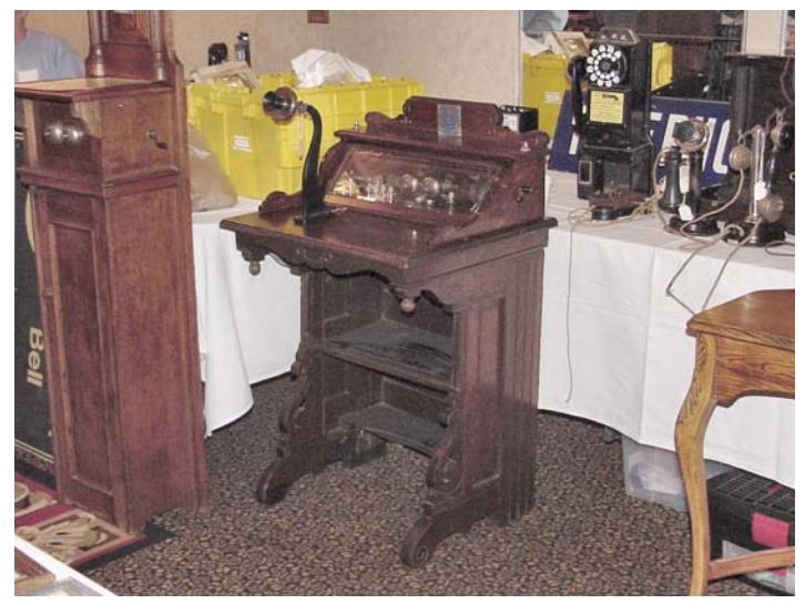
An 1892 vintage Western Electric Folding Vanity belonging to Pete Blanshard