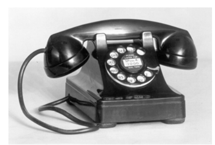
Western Electric Model 302

The design of the WE302 was not Dreyfuss' finest achievement. Rather, it was his first major work. He began with a design problem, which was combining the dial, handset, and switchhook with the contents of the "subscriber set" (bells and network). The WE202 or B1 handset mounting with its E1 handset was, despite my fondness for the set, a rather awkward design. The handset was oversized and cumbersome, and heavy to hold for a prolonged period. The base used a single plunger. One has to bear in mind that Bell was behind the curve when it came to creating a "combined" set (with a base containing all components, requiring no subset or "ringer box"). Several other telephone manufacturers had combined sets in use well before 1937 when the WE302 came out – including the Kellogg 925, the Stromberg Carlson 1212, the AE #2 Monophone, as well as several European phones. Dreyfuss worked with Bell Laboratories to create the first combined set for the Bell System. He used the same kind of dial (3 inch dial) as was used by the