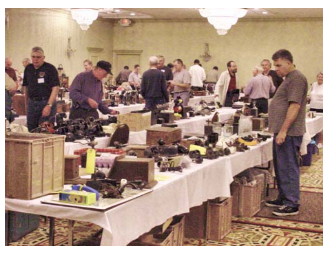
A typical view of a portion of the show floor.