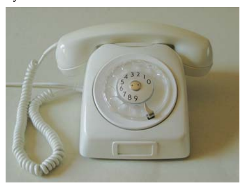
LM Ericsson Dialog (1962)

but also resembles the Dialog (1962), made by Ericsson Sweden.