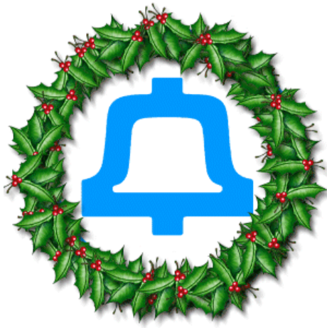
Bell Logo is a trademark of the Regional Bell Operating Companies

(Sale ends December 31, 2004) Special Sale for ATCA/TCI members