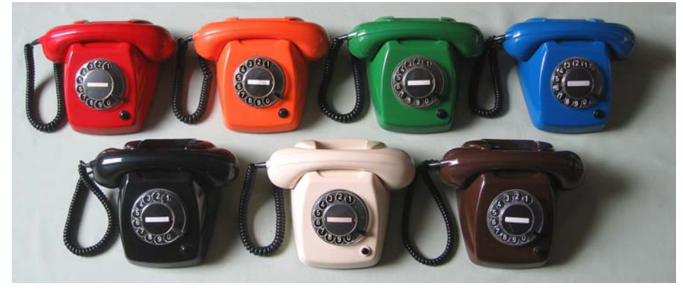
Colored T 65's in ruby red, orange, emerald green, azure bleu, black, ivory and mocha

The colored T 65 "de Luxe" becomes available nationwide on October 15 1973.