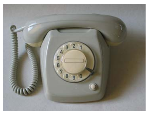
The T 65

In 1965, a new standard telephone was being developed by Dutch PTT in close cooperation with the German manufacturer, Krone: The T 65.