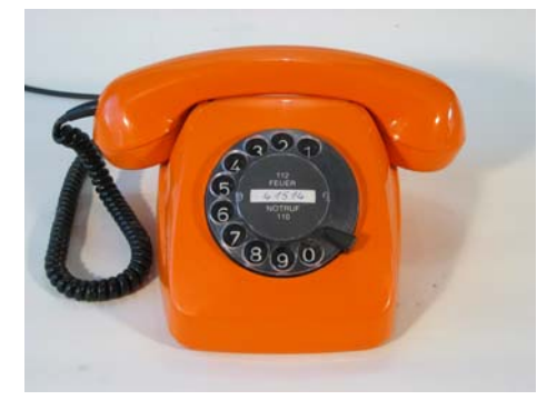
Fe Ap 61 (1961)

The German firm, Krone, designed the case. There is some talk of plagiarism, as the T 65 looks very much like the new phone of the German Bundespost, the Fe Ap 61 (1961),