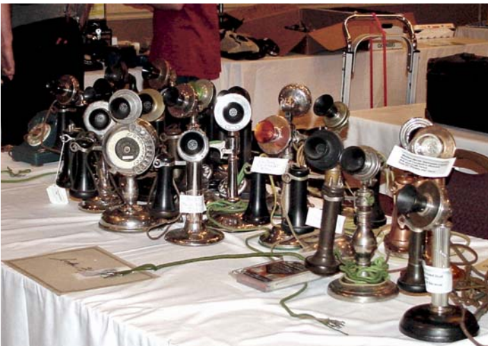
Above Pictures: A plethora of desk stands on Jonathan Katz's table.